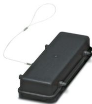
Protective cover B16, for double locking latch, protective cover material: PA, height: 21.6 mm, seal: yes

Please be informed that the data shown in this PDF document is generated from our online catalog. Please find the complete data in the user documentation. Our general terms of use for downloads are valid.