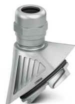
EVO EMC cable gland with bayonet locking, B series, size M25, cable diameter: 11 ... 16 mm

Please be informed that the data shown in this PDF document is generated from our online catalog. Please find the complete data in the user documentation. Our general terms of use for downloads are valid.