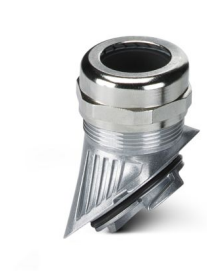
EVO EMC cable gland with bayonet locking, B series, size M40, cable diameter: 19 ... 27 mm

Please be informed that the data shown in this PDF document is generated from our online catalog. Please find the complete data in the user documentation. Our general terms of use for downloads are valid.