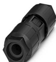
QUICKON cable connector, black, 4+PE-pos., 2.5 mm 2 ... 6.0 mm 2 /690 V/40 A, for cable diameter of 12 mm ... 20 mm.

Please be informed that the data shown in this PDF document is generated from our online catalog. Please find the complete data in the user documentation. Our general terms of use for downloads are valid.