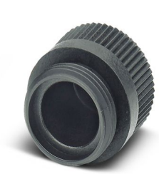
Sealing cap, 7/8", plastic, for flush-type connectors, for 7/8" sockets

Please be informed that the data shown in this PDF document is generated from our online catalog. Please find the complete data in the user documentation. Our general terms of use for downloads are valid.