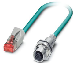
Assembled Ethernet cable, CAT5e, shielded, 2-pair, 26 AWG stranded (7-wire), RAL 5021 (water blue), M12 flush-type socket, rear/screw mounting with SPEEDCON to RJ45 plug/IP20, line, length 0.5 m

Please be informed that the data shown in this PDF document is generated from our online catalog. Please find the complete data in the user documentation. Our general terms of use for downloads are valid.