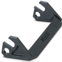
Replacement single locking latch for HEAVYCON EVO housing type B24, PA

Please be informed that the data shown in this PDF document is generated from our online catalog. Please find the complete data in the user documentation. Our general terms of use for downloads are valid.