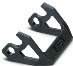
Replacement single locking latch for HEAVYCON EVO housing type B6, PA

Please be informed that the data shown in this PDF document is generated from our online catalog. Please find the complete data in the user documentation. Our general terms of use for downloads are valid.