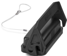
Protective cover B16, with single locking latch, protective cover material: PC, height: 26.3 mm, seal: yes

Please be informed that the data shown in this PDF document is generated from our online catalog. Please find the complete data in the user documentation. Our general terms of use for downloads are valid.