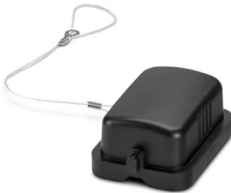
Protective cover B6, for single locking latch, protective cover material: PC, height: 26.3 mm, seal: no

Please be informed that the data shown in this PDF document is generated from our online catalog. Please find the complete data in the user documentation. Our general terms of use for downloads are valid.