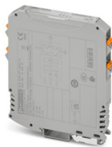
Electronic reversing load relay, for controlling DC motors, with LED display and protective circuit, output: 24 V DC/3 A with a switch-over time of 5 ms

Please be informed that the data shown in this PDF document is generated from our online catalog. Please find the complete data in the user documentation. Our general terms of use for downloads are valid.