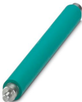
Standard pressure roller

https://www.phoenixcontact.com/us/products/0804655