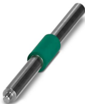
Pressure roller for all E-WM... and E-WMS... materials (for material width of up to 30 mm/1.18")

https://www.phoenixcontact.com/us/products/1259203