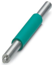
Pressure roller for continuous shrink sleeve

https://www.phoenixcontact.com/us/products/0804656