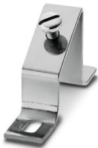
Angled brackets with M6 screw, for fixing DIN rails at an angle of 30°, height: 46 mm

Please be informed that the data shown in this PDF document is generated from our online catalog. Please find the complete data in the user documentation. Our general terms of use for downloads are valid.