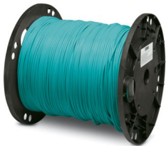
Cable reel, 8-position, TPE, highly flexible, turquoise, cable length: 100 m

Please be informed that the data shown in this PDF document is generated from our online catalog. Please find the complete data in the user documentation. Our general terms of use for downloads are valid.