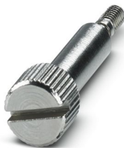
Connector screw for screwing on socket contact carriers and pin contact carriers

Please be informed that the data shown in this PDF document is generated from our online catalog. Please find the complete data in the user documentation. Our general terms of use for downloads are valid.