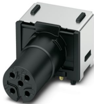
Contact carrier, 5-position, Socket, angled, M12, A-coding, THR solder connection

Please be informed that the data shown in this PDF document is generated from our online catalog. Please find the complete data in the user documentation. Our general terms of use for downloads are valid.