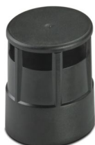
Siren element, 8 tones, 24 V AC/DC, max. 95 dB, 8 tones selectable by DIP switch, black

Please be informed that the data shown in this PDF document is generated from our online catalog. Please find the complete data in the user documentation. Our general terms of use for downloads are valid.