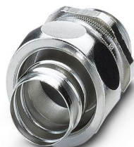
Cable gland made from brass with metric thread, IP40 protection

Please be informed that the data shown in this PDF document is generated from our online catalog. Please find the complete data in the user documentation. Our general terms of use for downloads are valid.