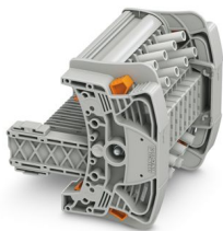
Test plug, number of positions: 7, color: gray

Please be informed that the data shown in this PDF document is generated from our online catalog. Please find the complete data in the user documentation. Our general terms of use for downloads are valid.