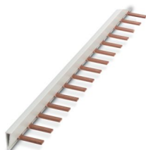
Insertion bridge, pitch: 18 mm, number of positions: 56, color: gray

Please be informed that the data shown in this PDF document is generated from our online catalog. Please find the complete data in the user documentation. Our general terms of use for downloads are valid.