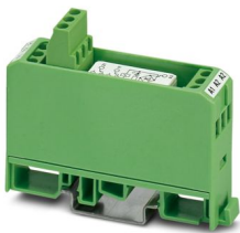
Relay module, with soldered-in miniature switching relay, contact (AgNi+Au): small to large loads, 2 changeover contacts, input voltage 48 V AC/DC

Please be informed that the data shown in this PDF document is generated from our online catalog. Please find the complete data in the user documentation. Our general terms of use for downloads are valid.