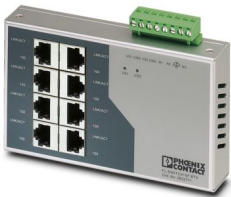
Ethernet Switch, 8 TP RJ45 ports, automatic detection of data transmission speed of 10 or 100 Mbps (RJ45), autocrossing function

Please be informed that the data shown in this PDF document is generated from our online catalog. Please find the complete data in the user documentation. Our general terms of use for downloads are valid.