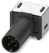
Contact carrier, 5-position, Pin, angled, M12, A-coding, THR solder connection

Please be informed that the data shown in this PDF document is generated from our online catalog. Please find the complete data in the user documentation. Our general terms of use for downloads are valid.