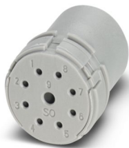
Contact insert, M23, number of positions: 8+1, contact connection type: Socket, Crimp connection, series: NC, RC, RM, TU, UC

Please be informed that the data shown in this PDF document is generated from our online catalog. Please find the complete data in the user documentation. Our general terms of use for downloads are valid.