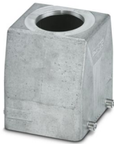
Sleeve housing B32, for double locking latch, material: Die-cast aluminum, salt water resistant, cable outlets: 1, straight, 1x M50, height: 94 mm, cable gland: none, Standard

Please be informed that the data shown in this PDF document is generated from our online catalog. Please find the complete data in the user documentation. Our general terms of use for downloads are valid.