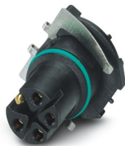
Contact carrier, Power, 5-position, Socket, straight, M12, K-coding, THR solder connection

Please be informed that the data shown in this PDF document is generated from our online catalog. Please find the complete data in the user documentation. Our general terms of use for downloads are valid.