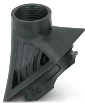
Plastic thread adapter with bayonet lock, for EVO housing series B, Pg13.5 thread

Please be informed that the data shown in this PDF document is generated from our online catalog. Please find the complete data in the user documentation. Our general terms of use for downloads are valid.