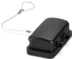
Protective cover B10, for double locking latch, protective cover material: PC, height: 26.3 mm, seal: yes

Please be informed that the data shown in this PDF document is generated from our online catalog. Please find the complete data in the user documentation. Our general terms of use for downloads are valid.