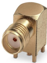
Coaxial PCB connector, degree of protection: IP20, number of positions: 1, 12 Gbps, material: Metal, connection method: Solder connection, cable outlet: straight, for additional information, see the product range drawing in the Download Center

Please be informed that the data shown in this PDF document is generated from our online catalog. Please find the complete data in the user documentation. Our general terms of use for downloads are valid.