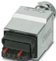
Power connector, degree of protection: IP65/IP67, number of positions: 5, material: Die-cast zinc, cable outlet: straight, Universal

Please be informed that the data shown in this PDF document is generated from our online catalog. Please find the complete data in the user documentation. Our general terms of use for downloads are valid.