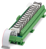
VARIOFACE output extension module, with 16 miniature relays, 1 changeover contact each, plugged, for 24 V DC (including relays)

Please be informed that the data shown in this PDF document is generated from our online catalog. Please find the complete data in the user documentation. Our general terms of use for downloads are valid.