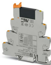
PLC-INTERFACE, consisting of PLC-BPT.../21 basic terminal block with push-in connection and plug-in miniature solid-state relay, for mounting on DIN rail NS 35/7,5, 1 N/O contact, input: 60 V DC, output: 24 - 253 V AC/0.75 A

Please be informed that the data shown in this PDF document is generated from our online catalog. Please find the complete data in the user documentation. Our general terms of use for downloads are valid.