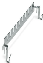
Ground rail for CTM protective plug when used in combination with LSA-PLUS disconnect strip. Version: 10 double conductors

Please be informed that the data shown in this PDF document is generated from our online catalog. Please find the complete data in the user documentation. Our general terms of use for downloads are valid.