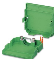
Cable housing, product range: KGG-MC 1,5, width: 14.5 mm

Please be informed that the data shown in this PDF document is generated from our online catalog. Please find the complete data in the user documentation. Our general terms of use for downloads are valid.