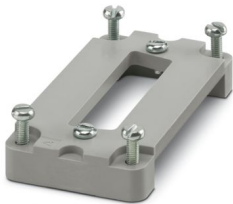
D-SUB adapter plate, for one D-SUB connector, no. of positions 37, housing series HC-B 16...

Please be informed that the data shown in this PDF document is generated from our online catalog. Please find the complete data in the user documentation. Our general terms of use for downloads are valid.