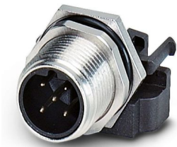
Device connector rear mounting, 5-position, Pin, straight, M12, B-coding, Wave soldering

Please be informed that the data shown in this PDF document is generated from our online catalog. Please find the complete data in the user documentation. Our general terms of use for downloads are valid.