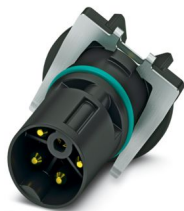
Contact carrier, Power, 5-position, Pin, straight, M12, K-coding, THR solder connection, Item is lead-free in accordance with RoHS II without Exemption 6c (Pb < 0.1 %)

Please be informed that the data shown in this PDF document is generated from our online catalog. Please find the complete data in the user documentation. Our general terms of use for downloads are valid.