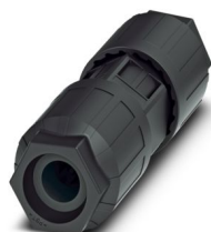
QUICKON cable connector, black, 4+PE-pos., 2.5 mm 2 ... 6.0 mm 2 /690 V/40 A, for cable diameter of 9 mm ... 14 mm.

Please be informed that the data shown in this PDF document is generated from our online catalog. Please find the complete data in the user documentation. Our general terms of use for downloads are valid.