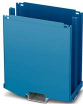
DIN rail housing, Lower housing part with metal foot catch, width: 50.1 mm, height: 100 mm, depth: 108.35 mm, color: blue (similar RAL 5015), cross connection: DIN rail bus connector (optional), number of positions cross connector: 8

Please be informed that the data shown in this PDF document is generated from our online catalog. Please find the complete data in the user documentation. Our general terms of use for downloads are valid.