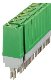
Relay connector, equipped with miniature switching relay, contacts (AgPd60): small loads, 1 N/O contact, input voltage 230 V AC, with light indicator, can be plugged on basic termination blocks

Please be informed that the data shown in this PDF document is generated from our online catalog. Please find the complete data in the user documentation. Our general terms of use for downloads are valid.