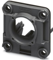
Panel mounting frame, IP67, for Freenet system, for round panel cutout, with grommet, without mounting screws, color: black

Please be informed that the data shown in this PDF document is generated from our online catalog. Please find the complete data in the user documentation. Our general terms of use for downloads are valid.