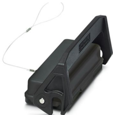
Protective cover B16, with single locking latch, protective cover material: PA, height: 21.6 mm, seal: yes

Please be informed that the data shown in this PDF document is generated from our online catalog. Please find the complete data in the user documentation. Our general terms of use for downloads are valid.