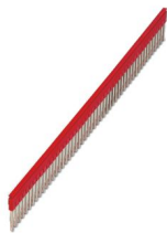
Plug-in bridge, pitch: 5.2 mm, number of positions: 50, color: red

Please be informed that the data shown in this PDF document is generated from our online catalog. Please find the complete data in the user documentation. Our general terms of use for downloads are valid.