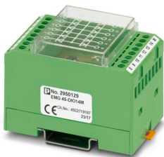
Diode module, with 14 diodes, common anode, diode type 1N 4007

Please be informed that the data shown in this PDF document is generated from our online catalog. Please find the complete data in the user documentation. Our general terms of use for downloads are valid.