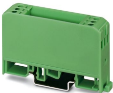
Electronic housing, with universal foot, for p.c.b. insertion, without screw connection terminal blocks and cover, pitch 5

Please be informed that the data shown in this PDF document is generated from our online catalog. Please find the complete data in the user documentation. Our general terms of use for downloads are valid.