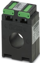
Bus-bar current transformer, 150 A AC primary current; 5 A AC secondary current; accuracy class 0.5; 2.5 VA rated power

Please be informed that the data shown in this PDF document is generated from our online catalog. Please find the complete data in the user documentation. Our general terms of use for downloads are valid.