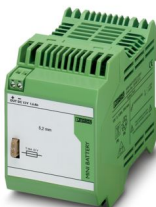
Battery module (device with battery), lead AGM, VRLA technology, 12 V DC, 1.6 Ah.

Please be informed that the data shown in this PDF document is generated from our online catalog. Please find the complete data in the user documentation. Our general terms of use for downloads are valid.