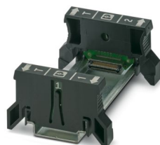
Axioline P terminator pair

Please be informed that the data shown in this PDF document is generated from our online catalog. Please find the complete data in the user documentation. Our general terms of use for downloads are valid.