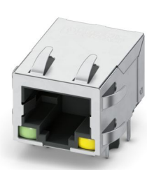
Filtered RJ45 PCB connectors, 1x1 single-port, connection direction of the connector to the PCB: 90 °, Tab down, Shielded, shield springs, LED (green, yellow), number of positions: 8, 1 Gbps, THT, Wave, type of packaging: Tray

Please be informed that the data shown in this PDF document is generated from our online catalog. Please find the complete data in the user documentation. Our general terms of use for downloads are valid.