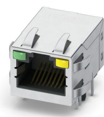
Filtered RJ45 PCB connectors, 1x1 single-port, connection direction of the connector to the PCB: 90 °, Tab up, Shielded, shield springs, LED (green, yellow), number of positions: 8, 1 Gbps, THT, Wave, type of packaging: Tray

Please be informed that the data shown in this PDF document is generated from our online catalog. Please find the complete data in the user documentation. Our general terms of use for downloads are valid.